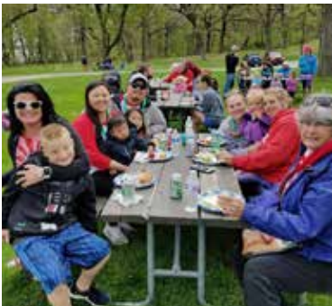
March of Dimes