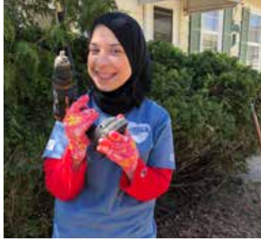
Project Home - Hammer with a Heart