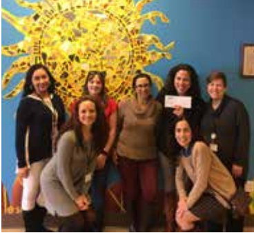
Centro Hispano of Dane County