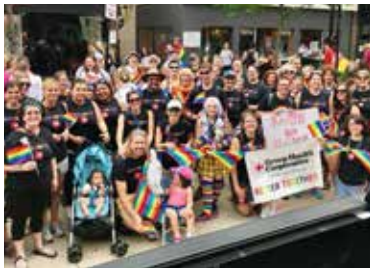
OutReach Pride Parade

At Group Health Cooperative of South Central Wisconsin (GHC-SCW), we care deeply for our community. We take pride in community involvement and we work together with community partners to find ways to provide real and compassionate care. Caring for our community means pushing beyond the walls of our clinics and into homes, schools, community centers, worksites, neighborhoods and places far and between.