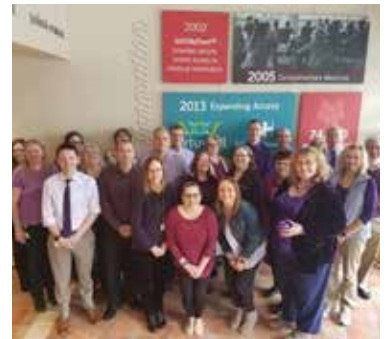
Purple Day: Supporting Epilepsy Around the World