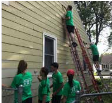
Project Home - Paint-a-Thon