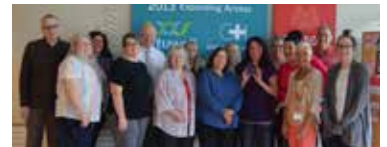
March of Dimes