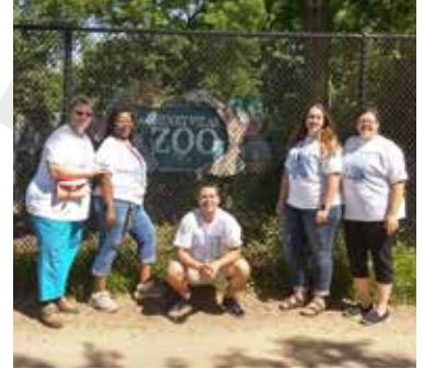
United Way Seasons of Caring