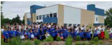
Among Language and Cultural Enrichment Program