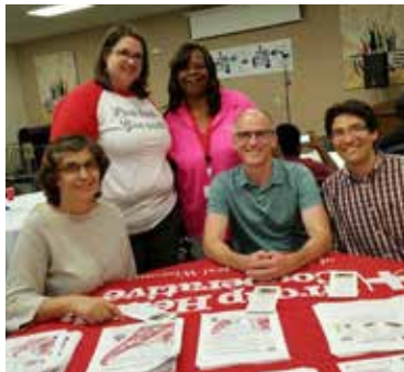
Meadowood Health Partnership