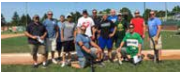
Project Home - Home Run Derby