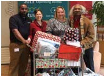
100 Black Men of Madison's Children with Responsibilities Toy and Donations Drive