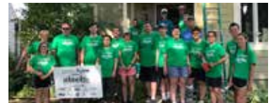
Project Home - Paint-a-Thon