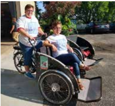
United Way Seasons of Caring