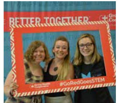
Go Red Goes STEM Conference