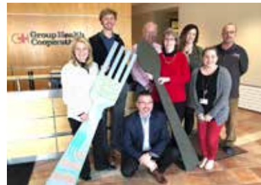
Feed the Need

We build upon approaches that have proven successful in addressing health care needs and the individual needs of our community. We create, foster and strengthen community partnerships to make a real difference. We combine resources and work together with others in the community to make an impact where we can.